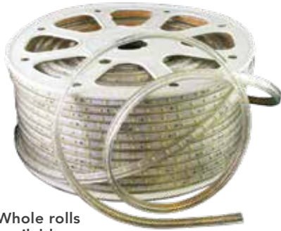
Whole rolls available