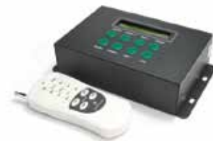
ZPW-DMX-C DMX Remote Controller Part #: DMX-Remote