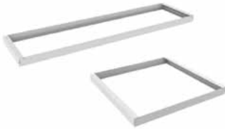
Surface Mount Kit