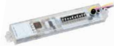
Internal Microwave Sensor ZL-MV-SENSOR-ANT-7