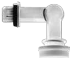
90° Microwave Sensor ZL-SENSOR-HB-HD07R