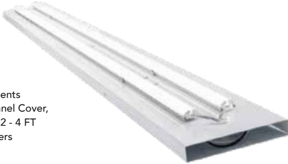
Image represents 1 - 4 FT Channel Cover, 8 FT Panel is 2 - 4 FT Channel Covers