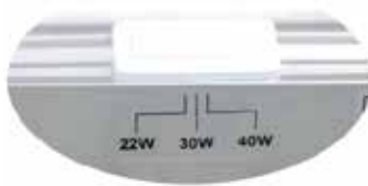
Slide Switch for Wattage Selection