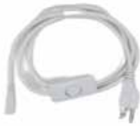
6ft On/Off Cable