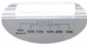
Slide Switch for CCT Selection