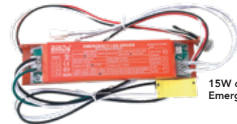
15W or 20W Emergency Driver