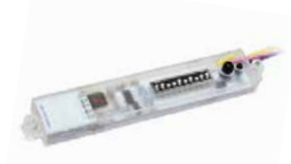
Internal Microwave Sensor ZL-MV-SENSOR-ANT-7