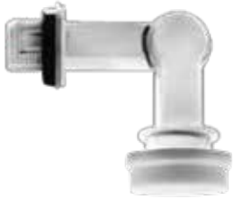
90° Microwave Sensor ZL-SENSOR-HB-HD07R