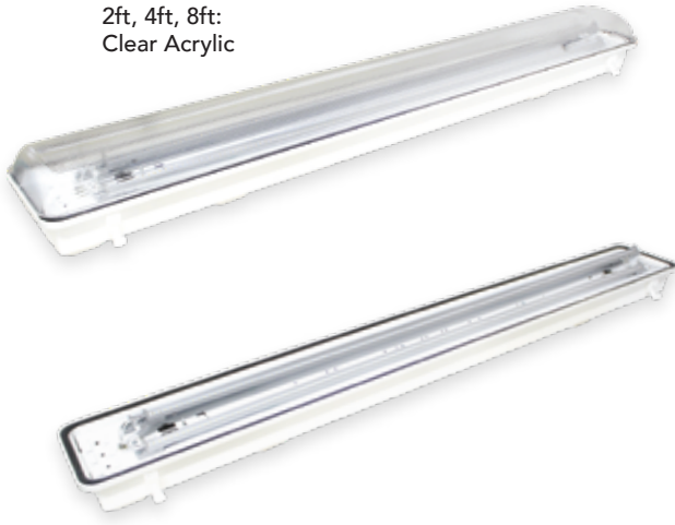
FIXTURE LENS 2ft, 4ft, 8ft: Clear Acrylic