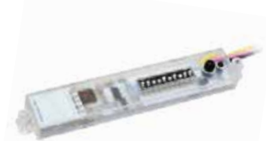
Internal Microwave Sensor ZL-MV-SENSOR-ANT-7