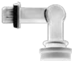
90° Microwave Sensor ZL-SENSOR-HB-HD07R