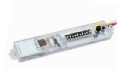
Internal Microwave Sensor ZL-MV-SENSOR-ANT-7