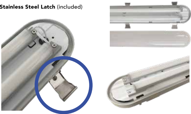
Stainless Steel Latch (included)