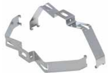
Stainless Steel (included)