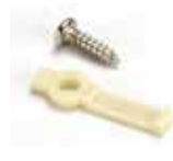
MTCLIPS-REEL Mounting clips 10/pk