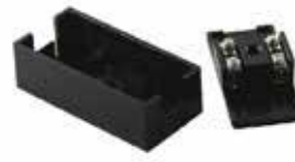
2W-JUNCTION-BLOCK 24V Terminal block 300W (12V MAX), 500W (24V MAX)