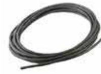
2W-JUMP, 4W-JUMP 2 Conductor jumper (18/2 AWG CL3R) 4 Conductor jumper (18/4 AWG CL3R)

Looking for unique solutions tailored to specific needs? ZLEDLighting specializes in creating custom projects that cater to client vision and requirements. Whether it's a specialized design, bespoke product, or a unique service, the team is here to help bring ideas to life.