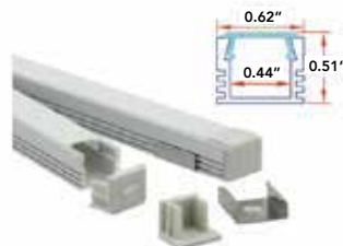
ZL-MC-1612 (-C OR -F) 4' aluminum mounting channel, Comes with 2 end caps and 2 mounting clips