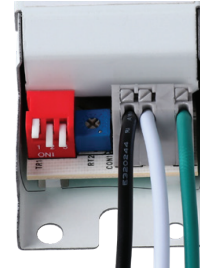
Tool-free Wattage Selectable Switch (red switch)