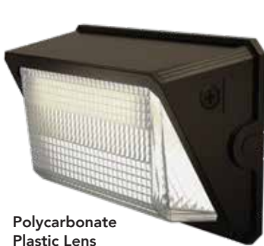
Polycarbonate Plastic Lens