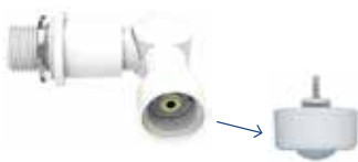
Part Number: ZL-MS-SENSOR-HB-ARM-ANT-6-4T Optional Part Builder Part Number: MS