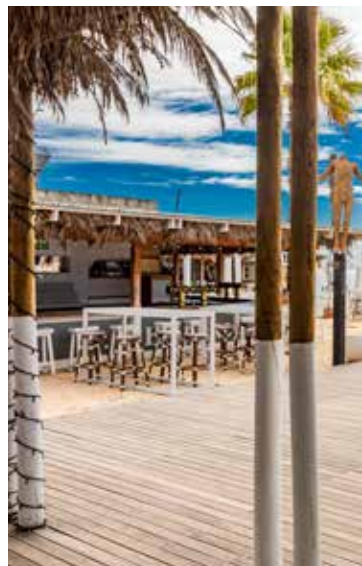
RESTAURANT / RETAIL